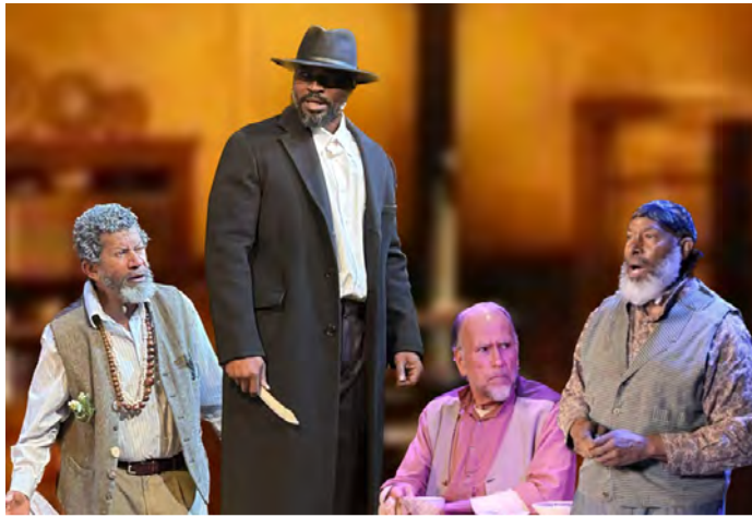
Photo of actors from Pittsburgh Playwrights Company digital program.